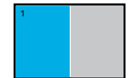
DUAL SPLIT SCREEN