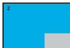
SINGLE PICTURE IN PICTURE