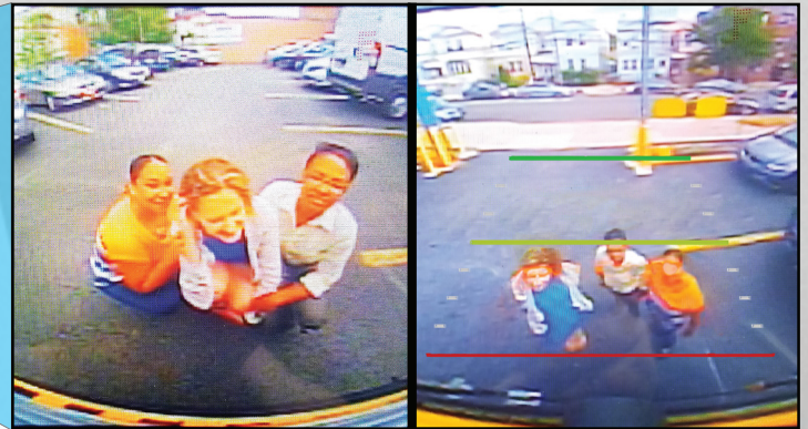
Enlarged view of rear and front of the bus.

Safe-T-Scope 270™ has been developed to reduce collisions and increase safety. Three camera images provide three views, in front of, behind & on desired side of the vehicle, reducing blind spots and displaying VRUs and other obstacles in blind zones.