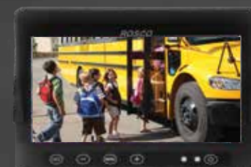
STSM251 - 7" Monitor

With the third camera option, you can also add a driver monitor for real-time backing up or interior views