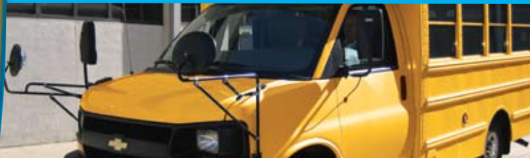
Type A Bus