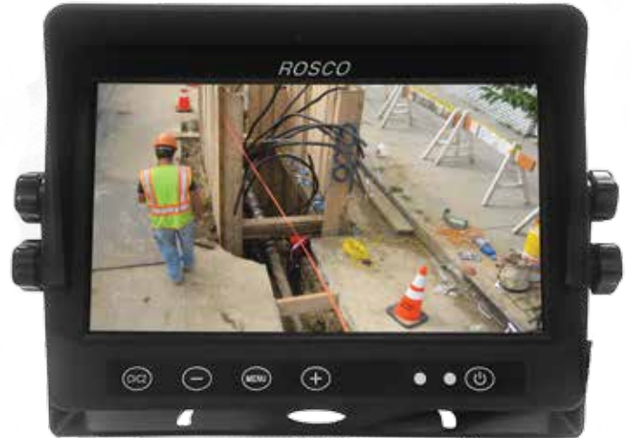
Optional U-Bracket Mount