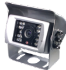
STSC141 Standard Camera