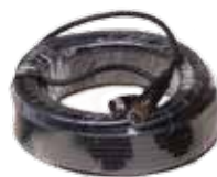
STSH303 Standard Harness