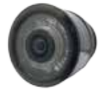
STSC106 Wide Angle Bullet Camera