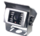
STSC141 Standard Mount Camera