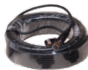
STSH303 Standard Harness