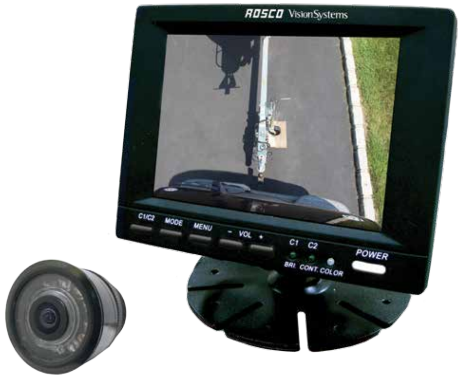
KIT P/N: STSK5833