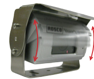
STSC127 Shutter Camera (camera lens is protected by automatic lens cover)