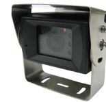
STSC107 Standard Camera (included in kit)