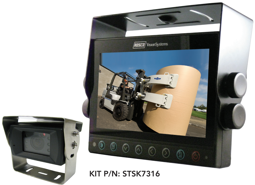
KIT P/N: STSK7316