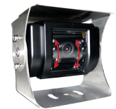
Optional Cameras: STSC117 Vertical Tilt Camera (camera lens automatically pivots up/down w/ trigger inputs)